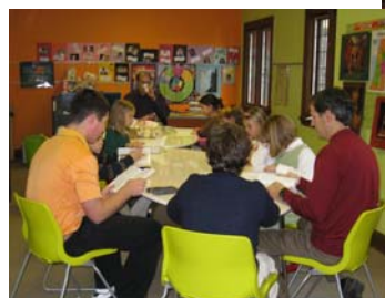
Grades 3-4 Sunday School, (below)