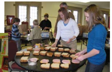
Grades 5, 6, 7 Sunday School making sandwiches for St. Johns (above)